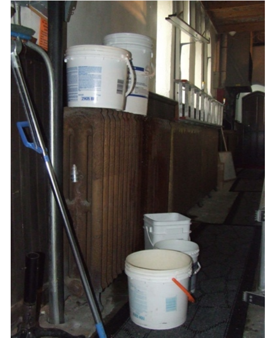
Buckets and buckets of water! The area behind the altar where the AC Unit is leaking.